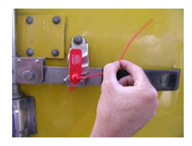
Pull the tail of the seal as much as possible to guarantee maximum security.