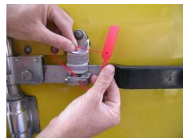
Insert the tail of the seal in the back hole of the seal head.